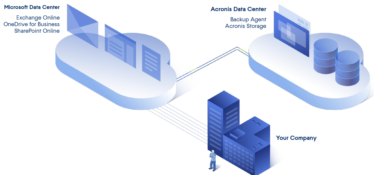
Figure 2. Acronis Backup for Office 365 with Cloud Deployment